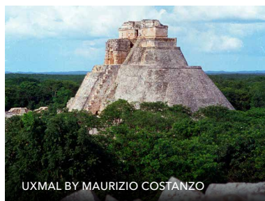
UXMAL BY MAURIZIO COSTANZO