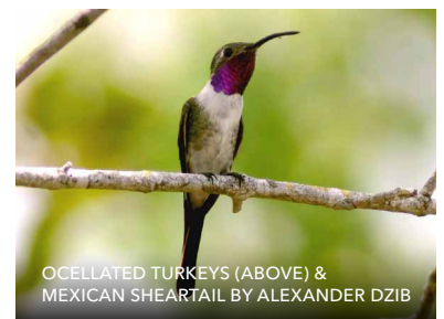
OCCELLATED TURKEYS (ABOVE) & MEXICAN SHEARTAIL BY ALEXANDER DZIB